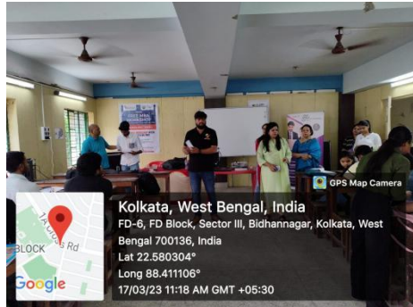
Kolkata, West Bengal, India FD-6, FD Block, Sector III, Bidhannagar, Kolkata, West Bengal 700136, India Lat 22.580304° Long 88.411106° 17/03/23 11:18 AM GMT +05:30