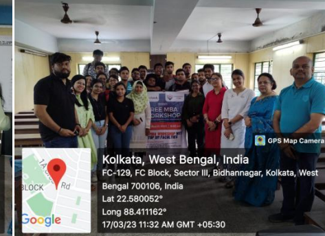
Kolkata, West Bengal, India FC-129, FC Block, Sector III, Bidhannagar, Kolkata, West Bengal 700106, India Lat 22.580052° Long 88.411162° 17/03/23 11:32 AM GMT +05:30