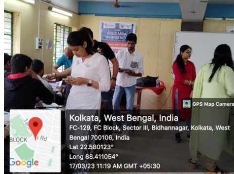
Kolkata, West Bengal, India FC-129, FC Block, Sector III, Bidhannagar, Kolkata, West Bengal 700106, India Lat 22.580123° Long 88.411054° 17/03/23 11:19 AM GMT +05:30