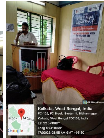
Kolkata, West Bengal, India FC-129, FC Block, Sector III, Bidhannagar, Kolkata, West Bengal 700106, India Lat 22.579981° Long 88.411068° 17/03/23 08:55 AM GMT +05:30