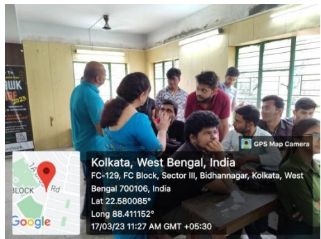
Kolkata, West Bengal, India FC-129, FC Block, Sector III, Bidhannagar, Kolkata, West Bengal 700106, India Lat 22.580085° Long 88.411152° 17/03/23 11:27 AM GMT +05:30